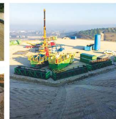
Zona e puseve 1386P dhe 2204P