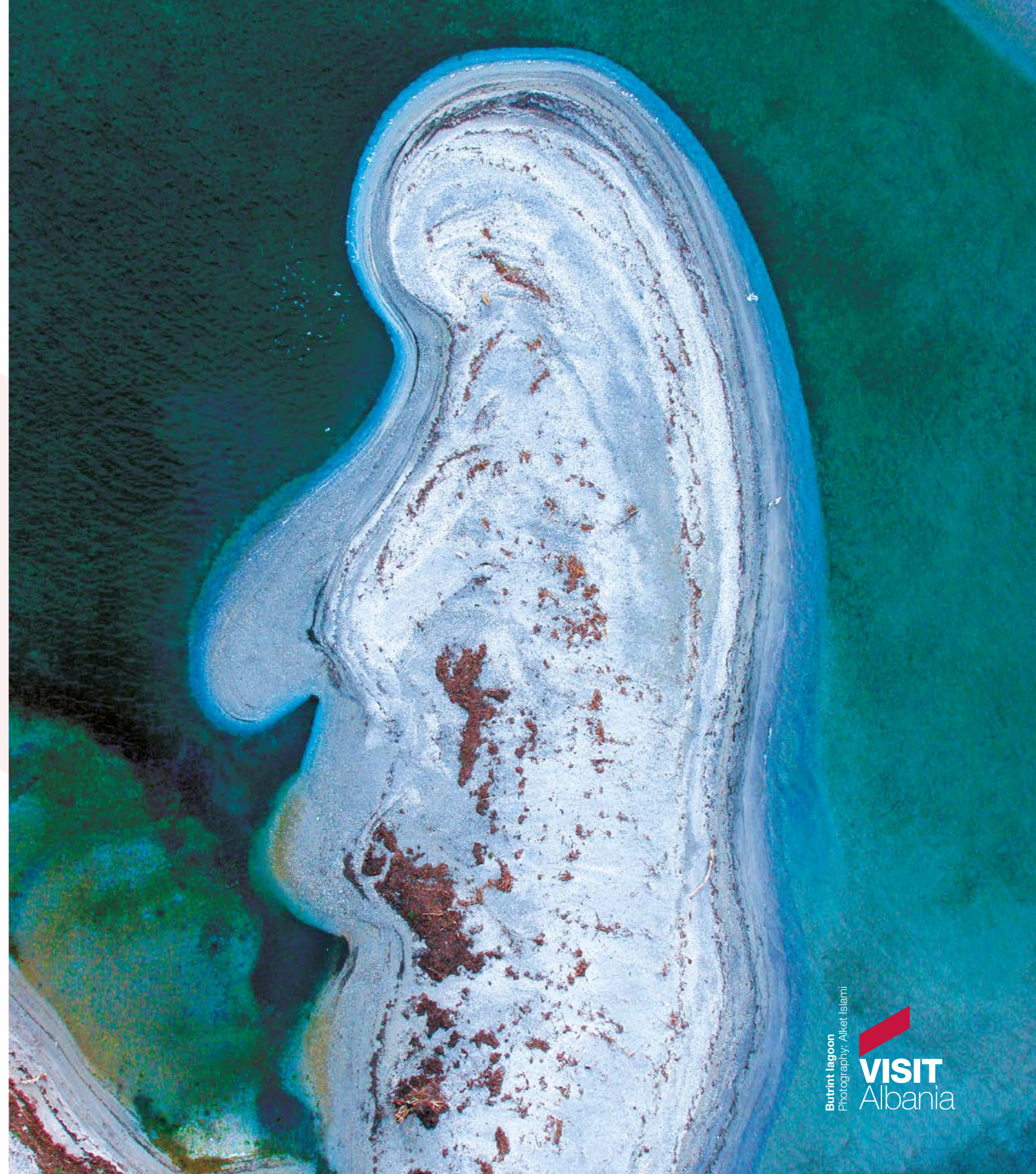
Butrint lagoon

The AmCham Business Index is one of the Chamber's most important publications as it reflects the opinion of its members on the business climate in the country and the level of ease with which businesses operate in the Albanian market. The AmCham Business Index provides a clear overview of the perception of our members of issues faced by them related to the country's economy, ranging from the most important factors of the business climate such as the level of corruption and informality to government policies affecting taxes and the businesses relationship with the tax authorities. The report's findings are very important to AmCham. Its' results help us guide and design the work plan and lobbying processes we should focus for the year. In its seventh edition, AmCham Business Index noted that the business climate has seen a slight improvement of 0.71 percent, noting a more positive perception of business climate among members, while reflecting a deterioration of the Business Index in several areas. These included monopoly and unfair competition, internal political climate, overall tax levels and government bureaucracy.