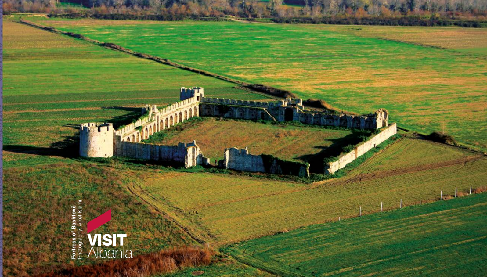
Fortress of Bashtovë