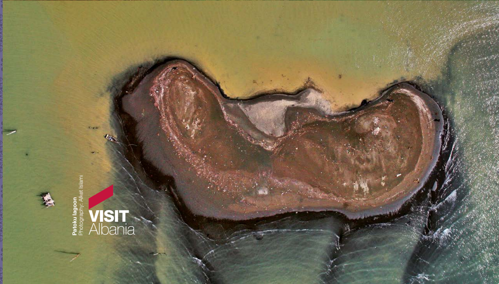
Patoku lagoon